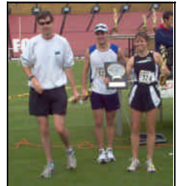
MIXED 5K TEAM 1st PLACE