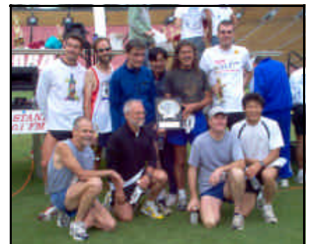
MEN'S 10K TEAM 3rd PLACE