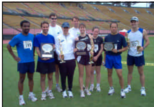
ALL PARC TEAM TROPHIES