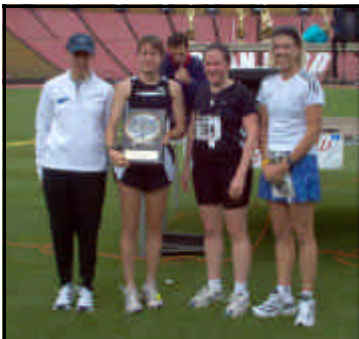
WOMEN'S 10K TEAM 1st PLACE