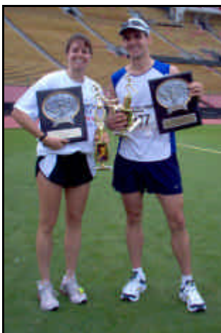
Ironwoman & Ironman